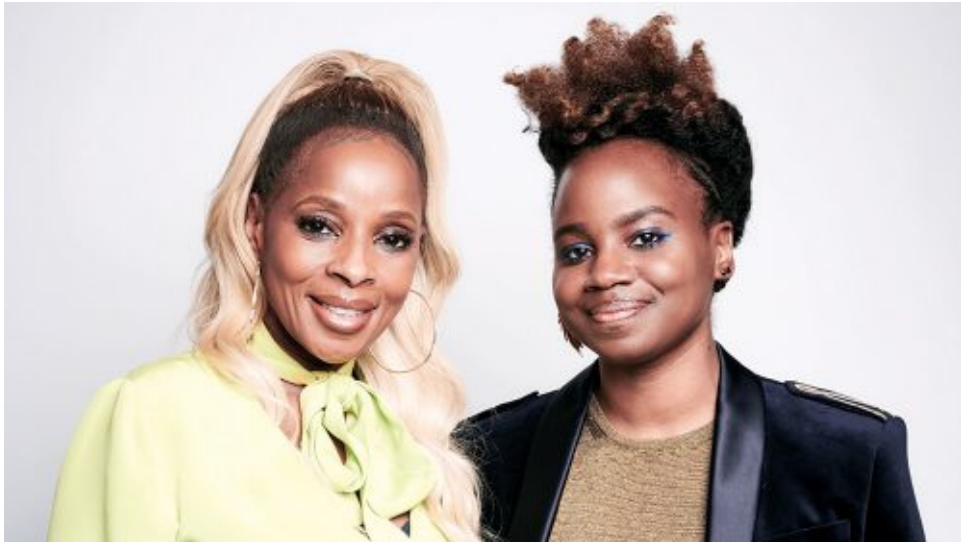
Mary J. Blige Dee Rees