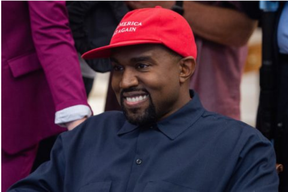
Kanye West