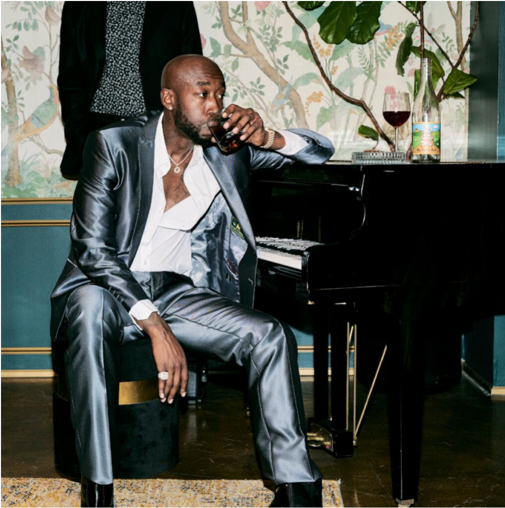
Freddie Gibbs