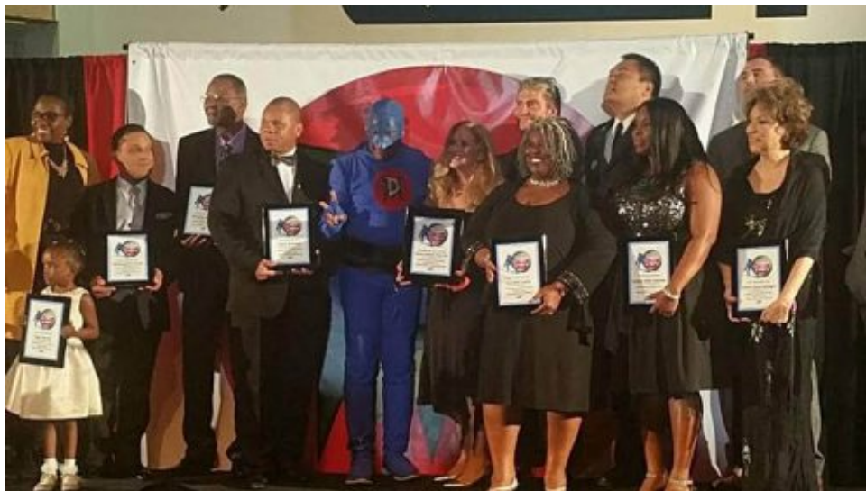
2016 DangerMan Hero Award Recipients