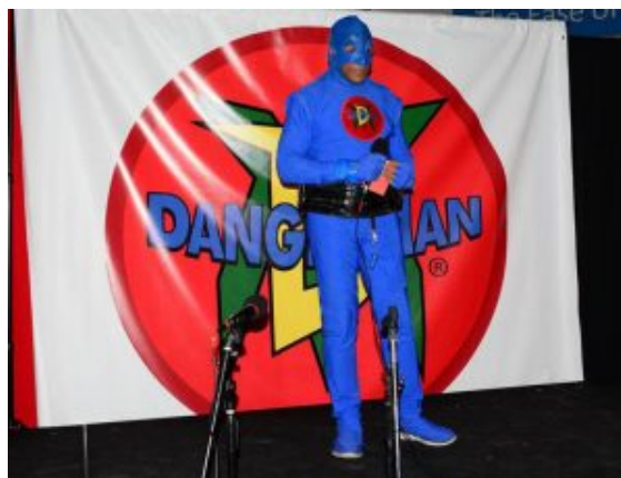
Real Life Urban Super Hero DangerMan