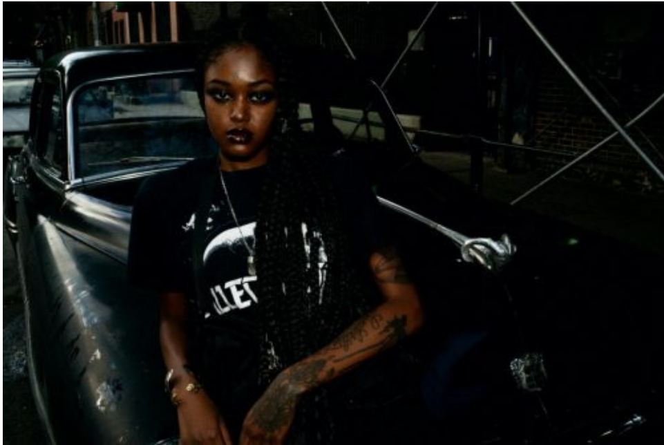
Chynna