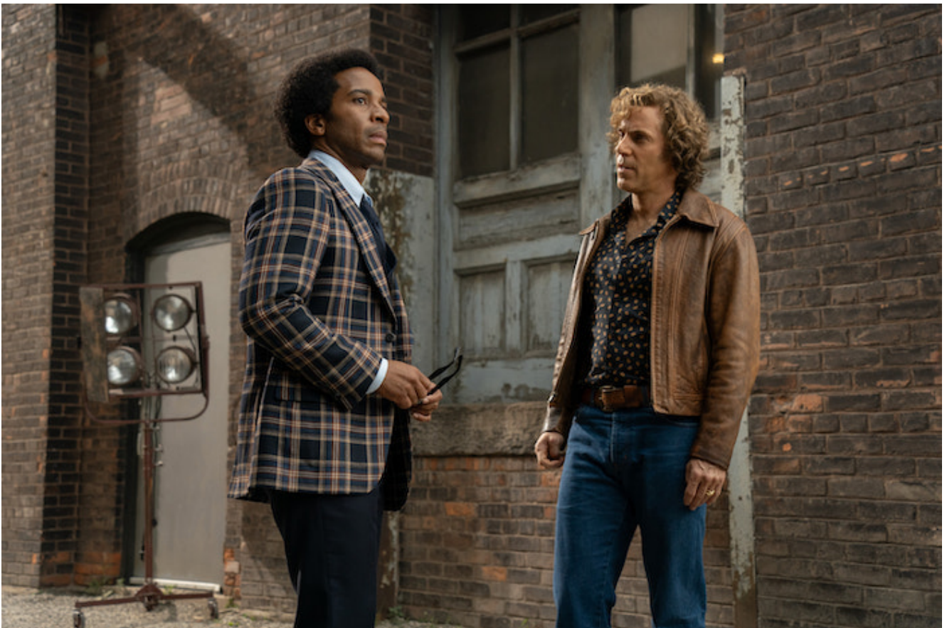
André Holland and Alessandro Nivola in "The Big Cigar," premiering May 17, 2024 on Apple TV+.