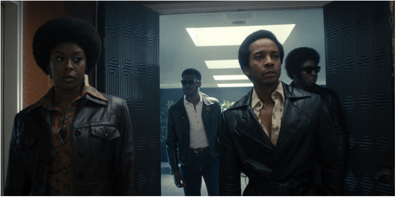
Moses Ingram and André Holland in "The Big Cigar," premiering May 17, 2024 on Apple TV+.