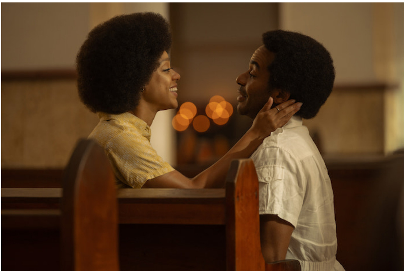
Tiffany Boone and André Holland in "The Big Cigar," premiering May 17, 2024 on Apple TV+.

André Holland stars as Newton in the series that premieres on May 17th and will stream every Friday until June 14th. The ensemble cast includes Glynn Turman, Alessandro Nivola, Tiffany Boone, P. J. Byrne, Marc Menchaca, Moses Ingram, Rebecca Dalton, Olli Haaskivi and Jordane Christie. Actor, producer and director Don Cheadle will direct and executive produce the first two episodes.