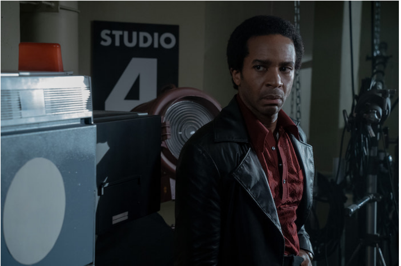
André Holland in "The Big Cigar," premiering May 17, 2024 on Apple TV+.