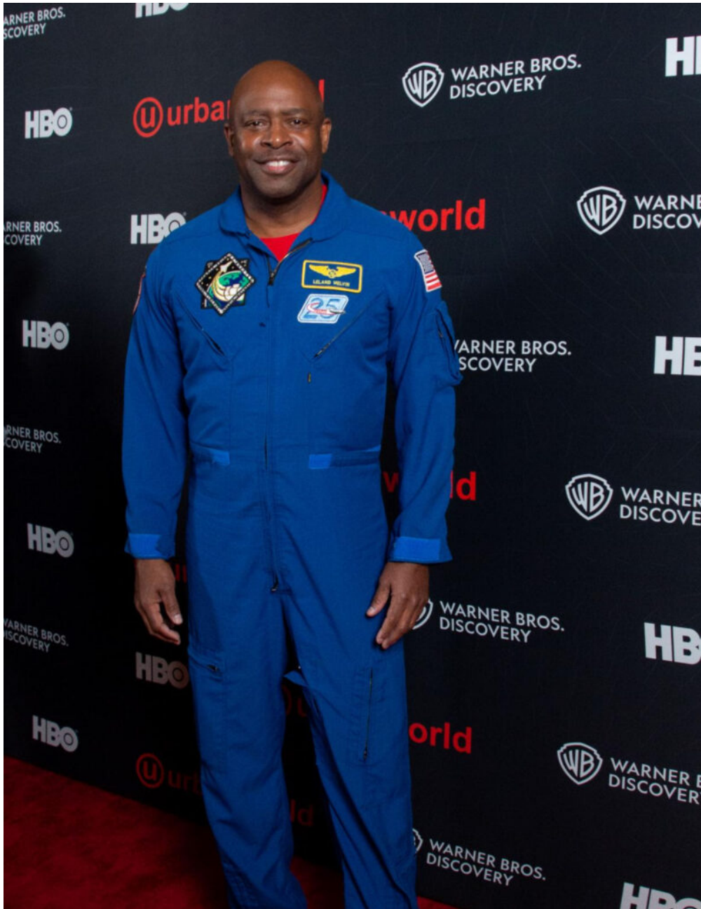
Retired Astronaut Leland Melvin (Executive Producer, 'The Space Race')