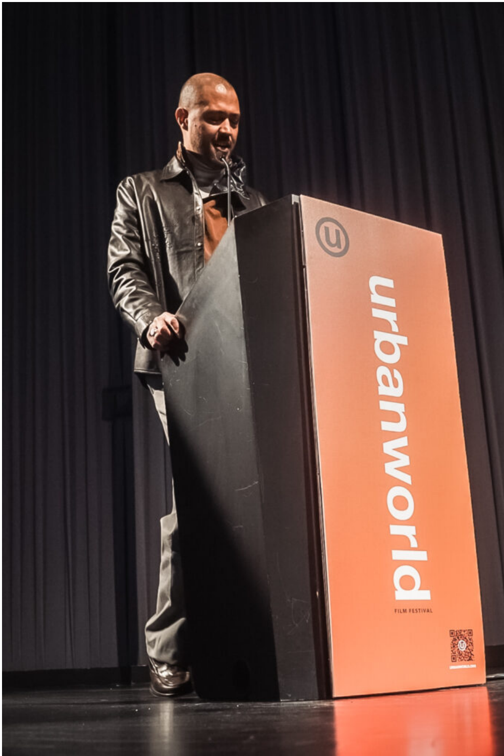
American Fiction director Cord Jefferson accepts the Visionary Award