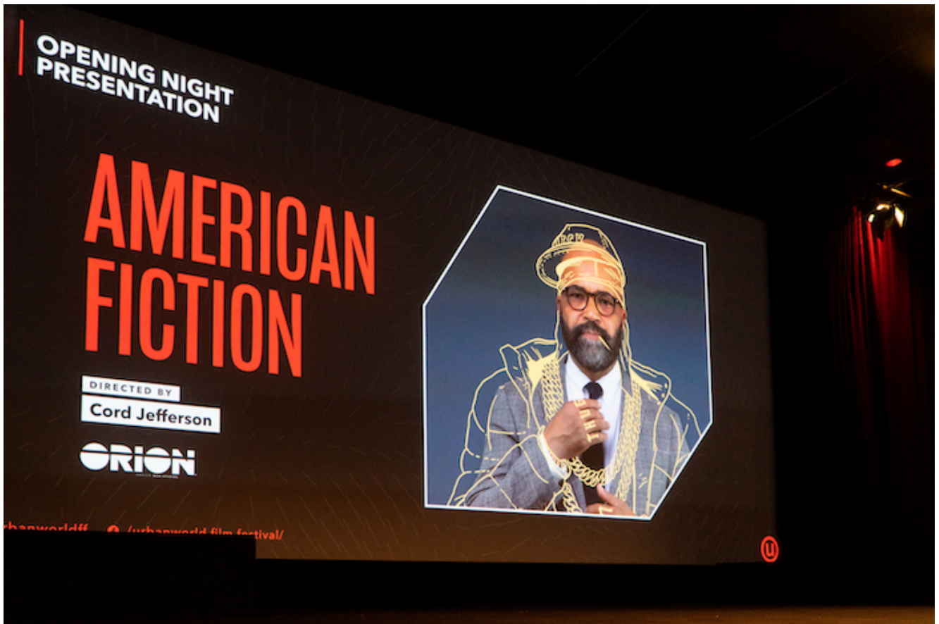
American Fiction Opening Night