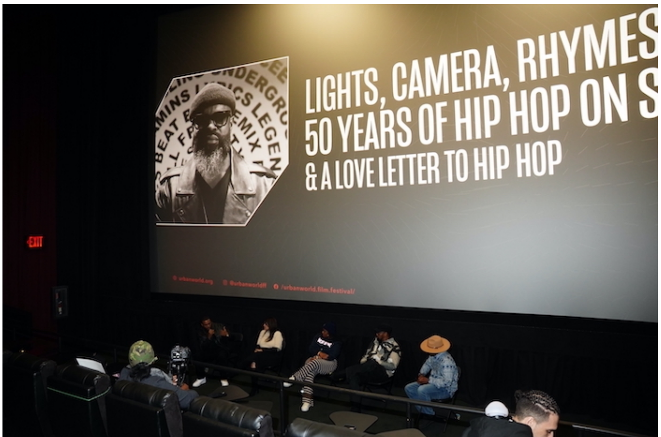
Screening Of A Love Letter To Hip Hop