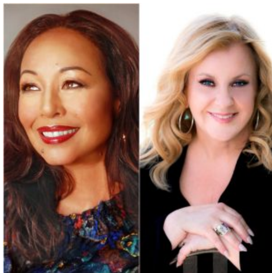
Yvonne Elliman (left) France Joli (right)

StarVista LIVE, the leader in nostalgia-based music cruise experiences, is adding a pair of classic dance music's legendary divas — Yvonne Elliman and France Jolie — to an already unprecedented superstar lineup for its newest uniquely themed voyage, the 2019 Ultimate Disco Cruise.