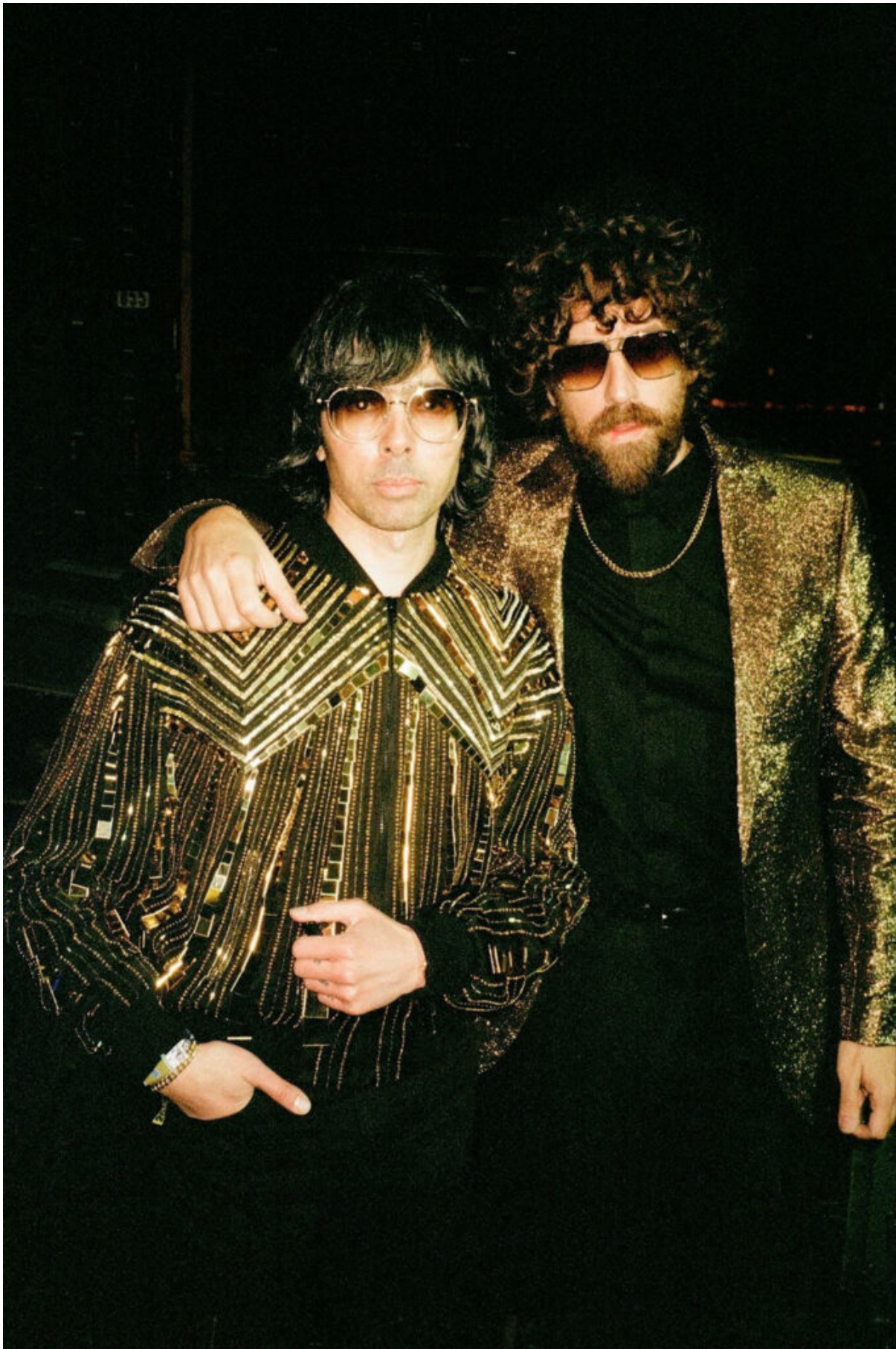
Justice by André ChémétouffYou